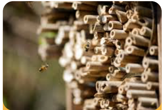
Insect Hotel, Cherry, Lita and Valerija

Create a place for insects to live, feed and feel at home on school grounds.