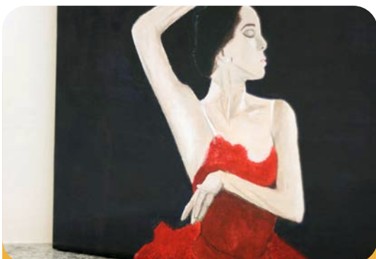
Ballet Dancer Painting, Paloma

Create a place for insects to live, feed and feel at home on school grounds.