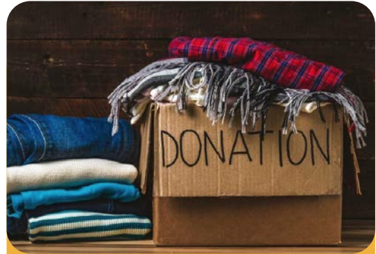
Clothing Drive, Kloi

A group of students go along and into the river to collect rubbish, do water quality tests, count fish population and so on.